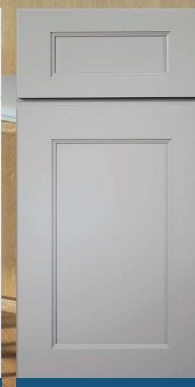
Brooklyn Modern Gray