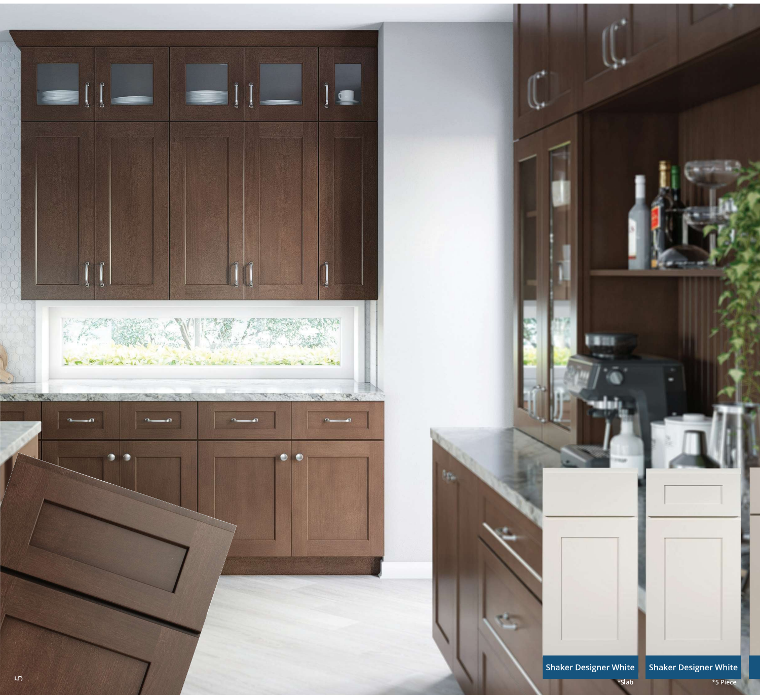
Shaker Designer White