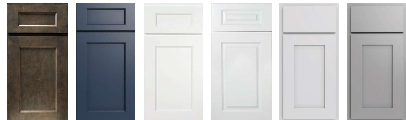
BROOKLYN SLATE (BS)