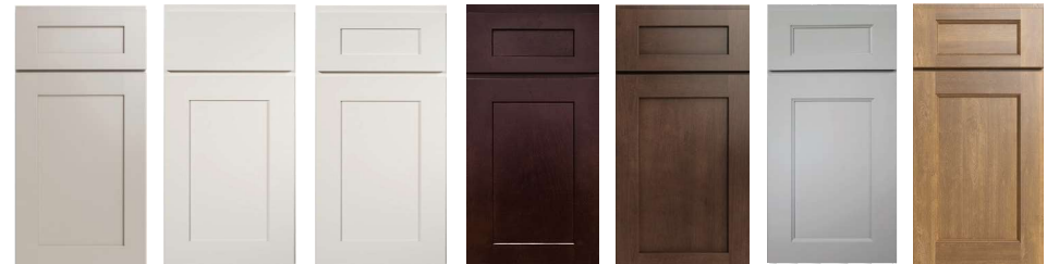
SHAKER SAND (SS)