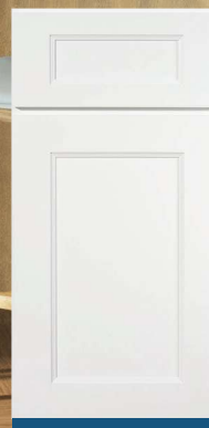
Brooklyn Bright White